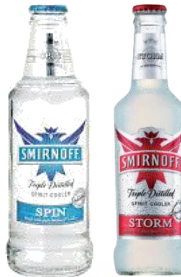
Smirnoff Spin & Smirnoff Storm