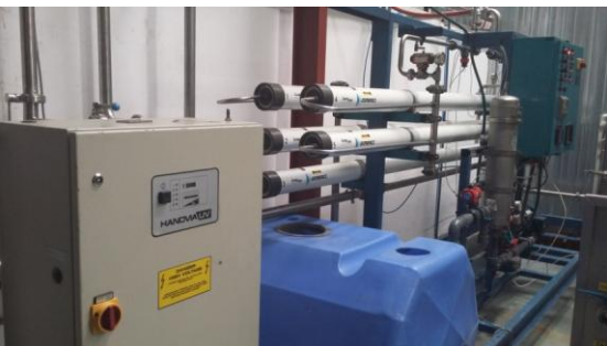
Reverse Osmosis Water Treatment Plant