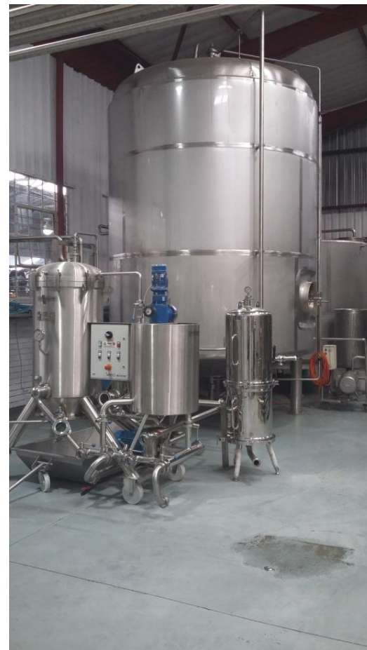
Pressurized Product Tank (For Sensitive Drinks) and Velo Filtration System