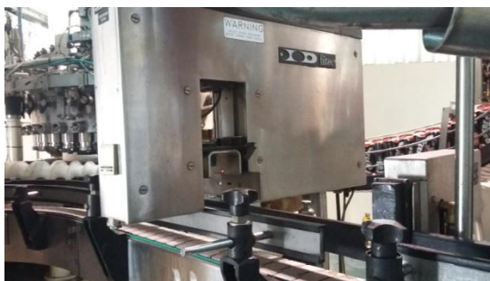
Can Fill Height Detector