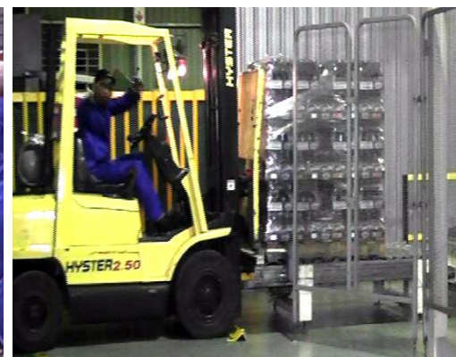
Palletizer & Stretch-wrapper

Our Glass Bottle Line runs a variety of bottle sizes, ranging from 275ml to 500ml, and can apply twist-off and pry-off crowns, as well as aluminium ROPP closures. Sensitive drinks have access to the Tunnel Pasteurizer.