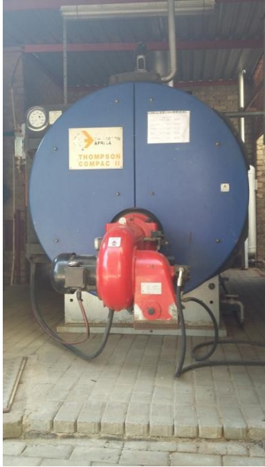
The Fuel Boiler House