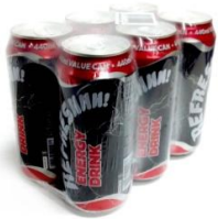
Refreshhh energy Drink