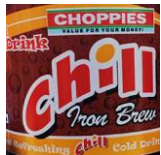
Choppies Carbonated Soft Drinks (Cans)