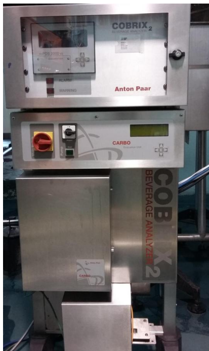
In-Line Brix & CO 2 Analyser