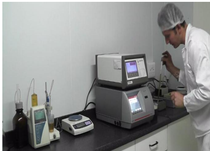
Quality Control Laboratory

The product Brix and carbonation levels are continuously monitored in-line by the Cobrix 2 (Anton Paar), and the line will stop if the levels deviate from specification.