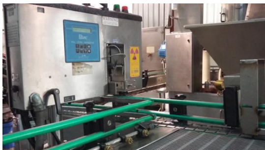
Glass Bottle Fill Height Detector