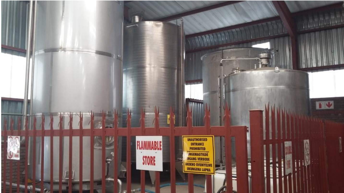
High Strength Alcohol – Bonded Warehouse