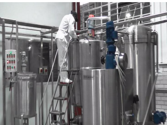
Ingredients Premix Tank