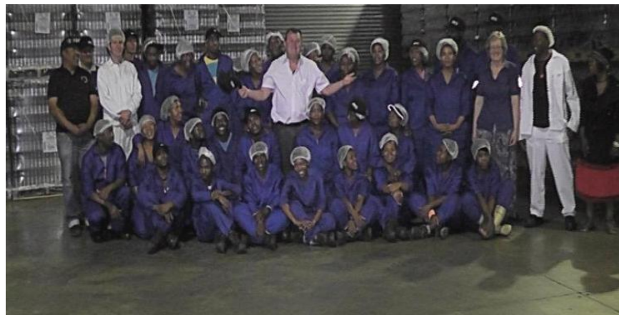
The CPS Team

Our mission is to supply a quality service to our customers in the beverage industry. Our advanced technical capability enables us to achieve production targets while strictly adhering to quality and delivery commitments.