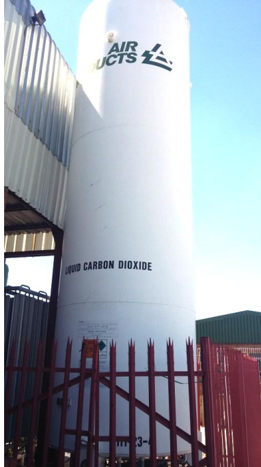
The CO 2 Plant