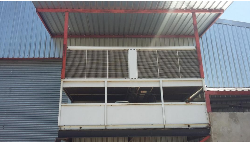
Refrigeration Plant (For product cooling before carbonation)

Waste water from the Reverse Osmosis Plant is collected and reused for the restroom facilities as well as general cleaning of the plant. This initiative has made a huge impact on the conservation of water, as well as raising awareness among the staff.