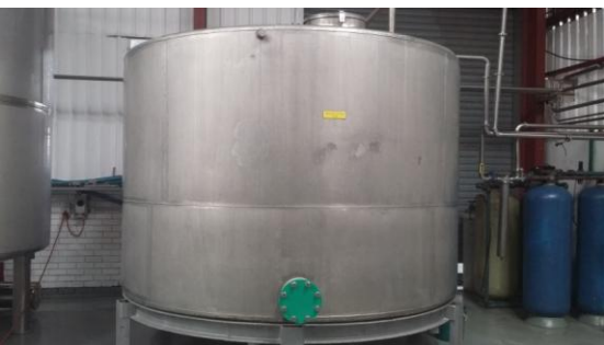
Demineralised Water Storage Tank