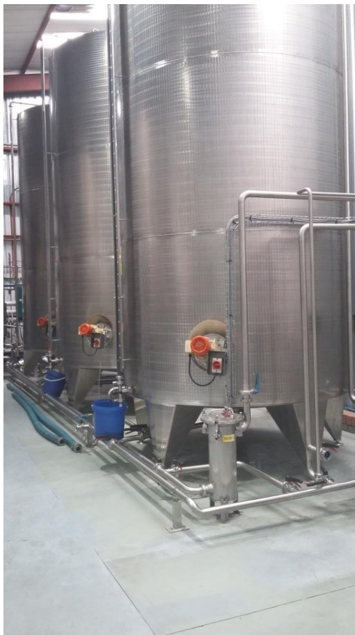
Product Tanks (20,000L each)